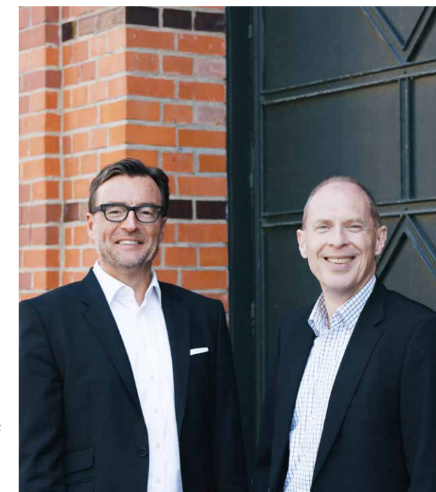
Hamburg, June 2019

We thank our business partners for the trust bestowed upon us and would like to express our appreciation to our employees for their commitment to the continuous further development of Varengold Bank AG. The achieved year-end profit of the bank is not least the result of valuable cooperation of the entire Varengold team with our customers and we are determined to pursue this path of success. The positive development in 2018 continued into the first months of financial year 2019. In 2019 we have implemented additional measures to boost business growth. In this light, we anticipate even further positive results than in 2018.